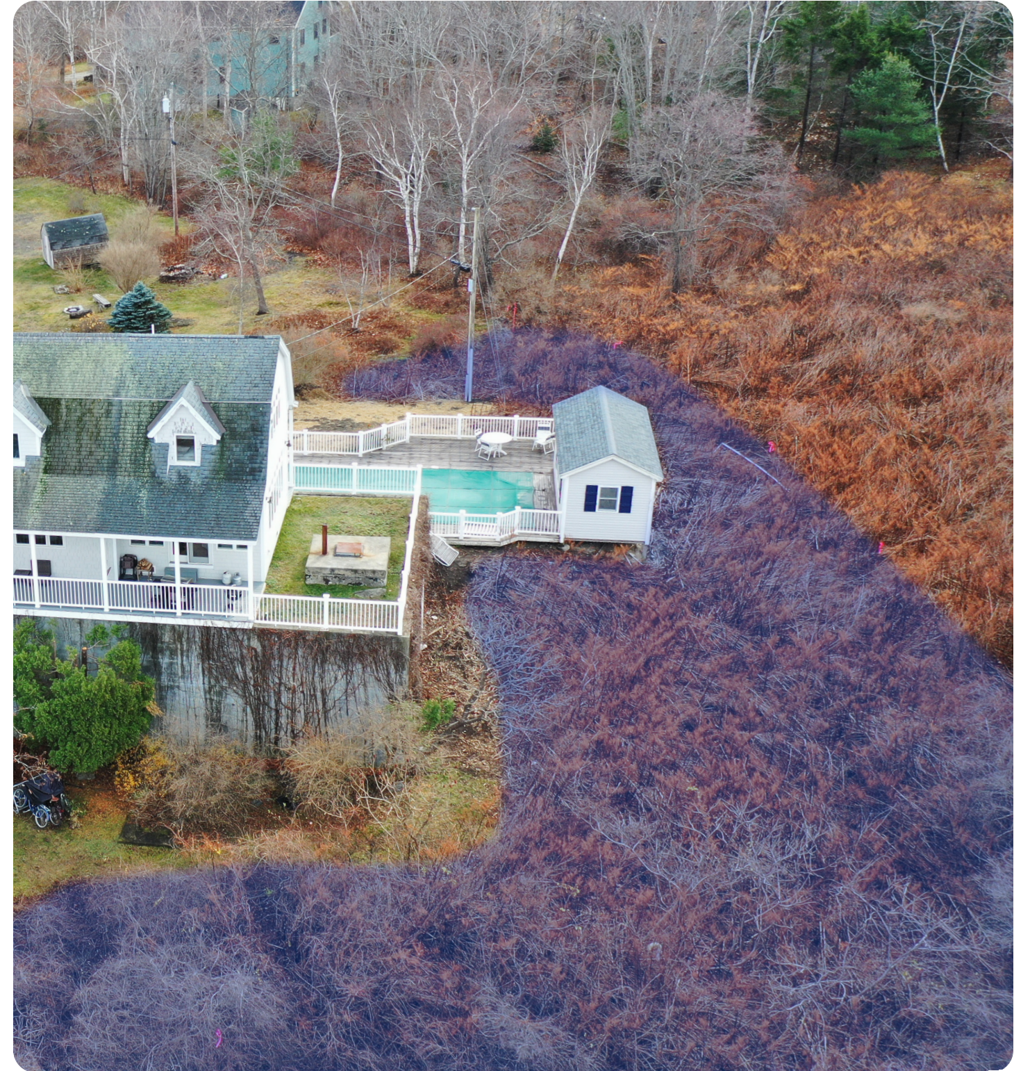
An aerial view of the Landsman residence. The orange vegetation shows a Knotweed monoculture that extends beyond the property boundary. The area that this plan proposes for invasive management and removal is highlighted in blue and includes Knotweed, Shrub Honeysuckle, and Bittersweet.