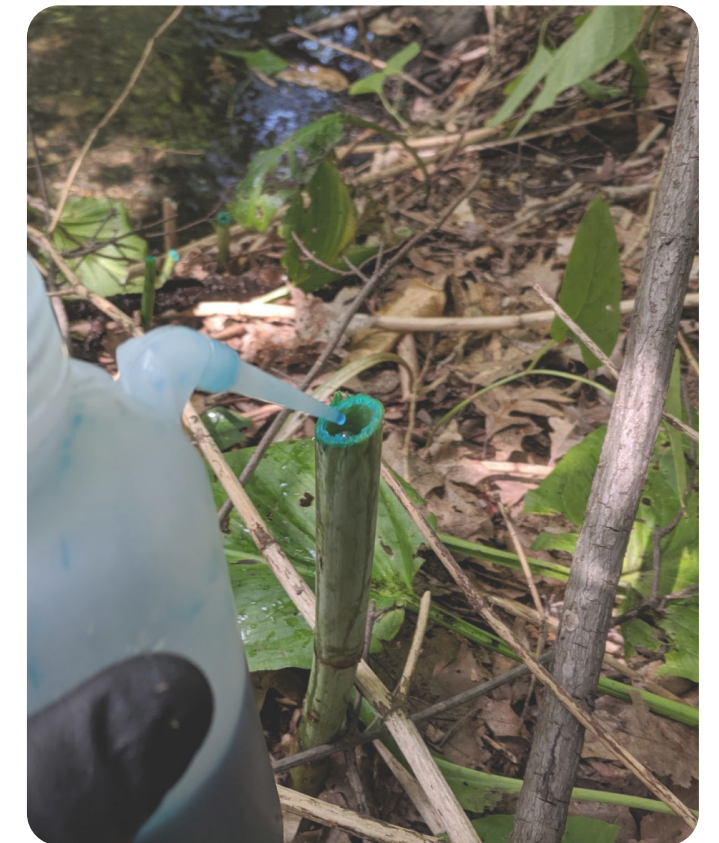
Herbicide application by licensed technician

When foliar application is not an option (Knotweed in sensitive areas and/or mixed with desired plants) or for smaller patches of Knotweed stem application is an option. For large populations, the large stems are cut at 18 inches. The remaining stems are then treated between the first and second nodes with a 50% solution of glyphosate that is put into the hollow tube of the stem and its walls. This should be done for consecutive 2-5 seasons.