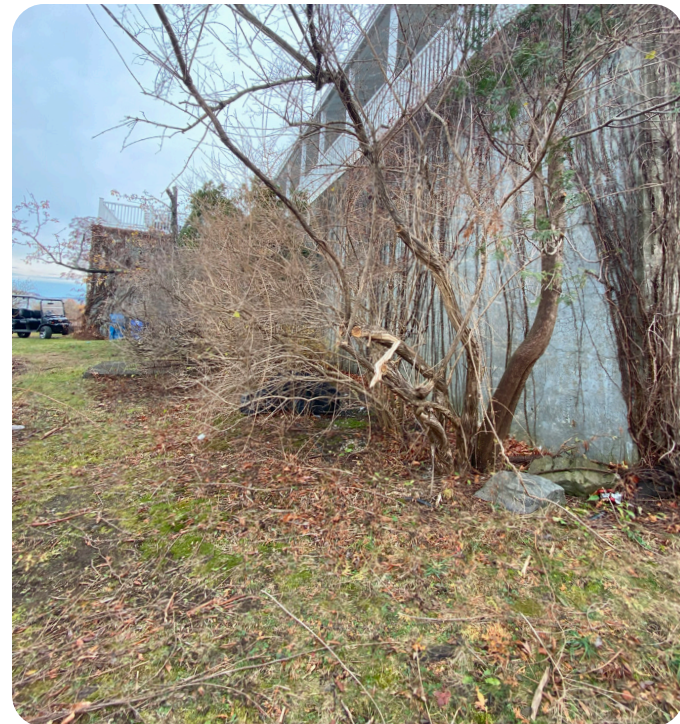
(Below) Mature Lonicera morrowii Shrub Honeysuckle, along the foundation of the home.