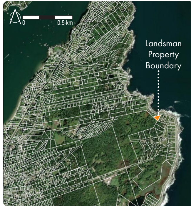
Map the of residential parcels on Peaks Island including the Landsman property boundary and the large natural area parcels to the West.

This plan identifies the invasive plants we propose to remove, describes each, and details best management practices for control and management. The plan also includes a narrative for proposed native restoration and specifying plant species. Finally, it provides a detailed maintenance calendar for all aspects of proposed management and ecological restoration over an extended timeline.