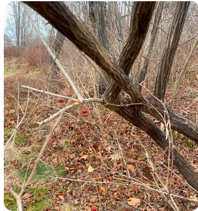
(Below) Rosa multiflora , Multiflora Rose & Lonicera japonica , Shrub Honeysuckle are intertwined.