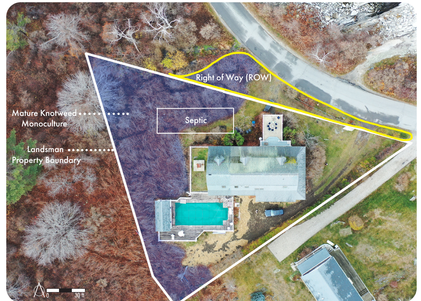
An aerial view of the Landsman property shows the bright orange vegetation of a mature Knotweed monoculture encroaching from the West. The area of Knotweed that this plan proposes for invasive management and removal is highlighted in blue.

Native plant restoration will be managed by Matthew Cunningham Landscape Design (MCLD), a team specializing in native plant garden design.