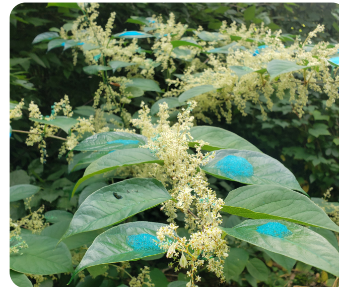
Foliar herbicide application by licensed technician

After the Knotweed has been cut in early June, the plant will respond by utilizing stored carbohydrates, further reducing the plant's vigor. The herbicides used for a foliar application move through the plant. To control the rhizomes, the application needs to be made later in the season, when the movement of carbohydrates is back to the rhizomes for growth and storage.