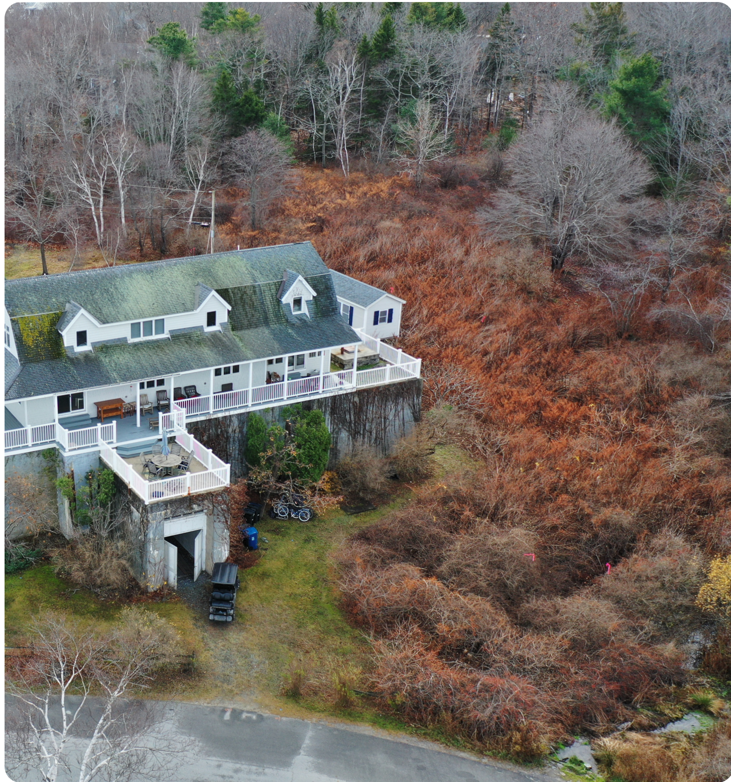
A view of the Landsman residence and the vegetation behind the home. The orange vegetation shows a Knotweed monoculture that extends beyond the property boundary.