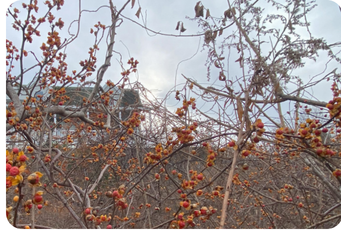
(Above) A bramble of Celastrus orbiculatus , Bittersweet, at the front of the property.