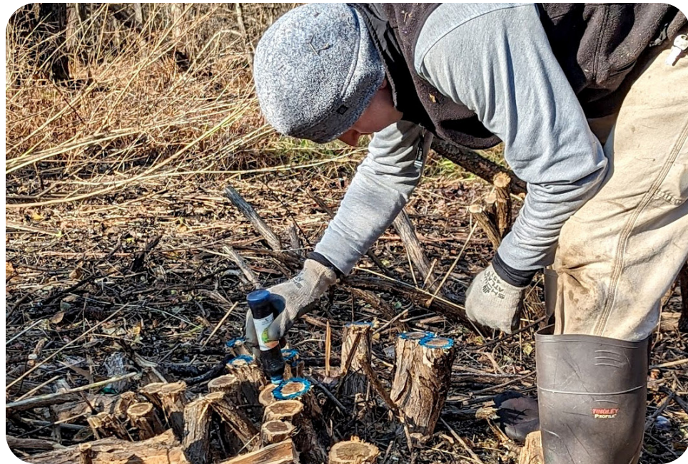
Licensed applicators with required Personal Protective Equipment paint the stems of invasive species after cutting.

All invasive plant species that have a base greater than 1" in caliper will be addressed with herbicide application. Invasive plants of this size usually have extensive fibrous root systems which provide beneficial soil stabilization and are best left in situ. Unfortunately, they also maintain the ability to resprout, which is why we propose a cut and dab method with Garlon 3A™ (a triclopyr-based herbicide) on individual cut stumps. Licensed Herbicide Applicators will complete all treatments.