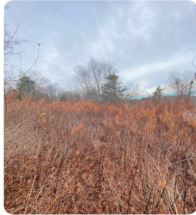
(Above) Fallopia japonica , Knotweed, is encroaching on the property from the West.