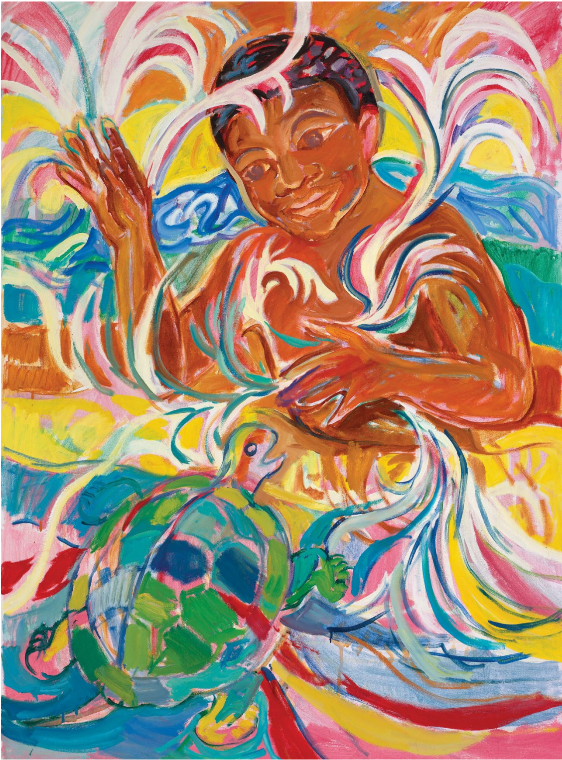
Ashley Bryan (United States, 1923-2022) Turtle Knows Your Name, 1989