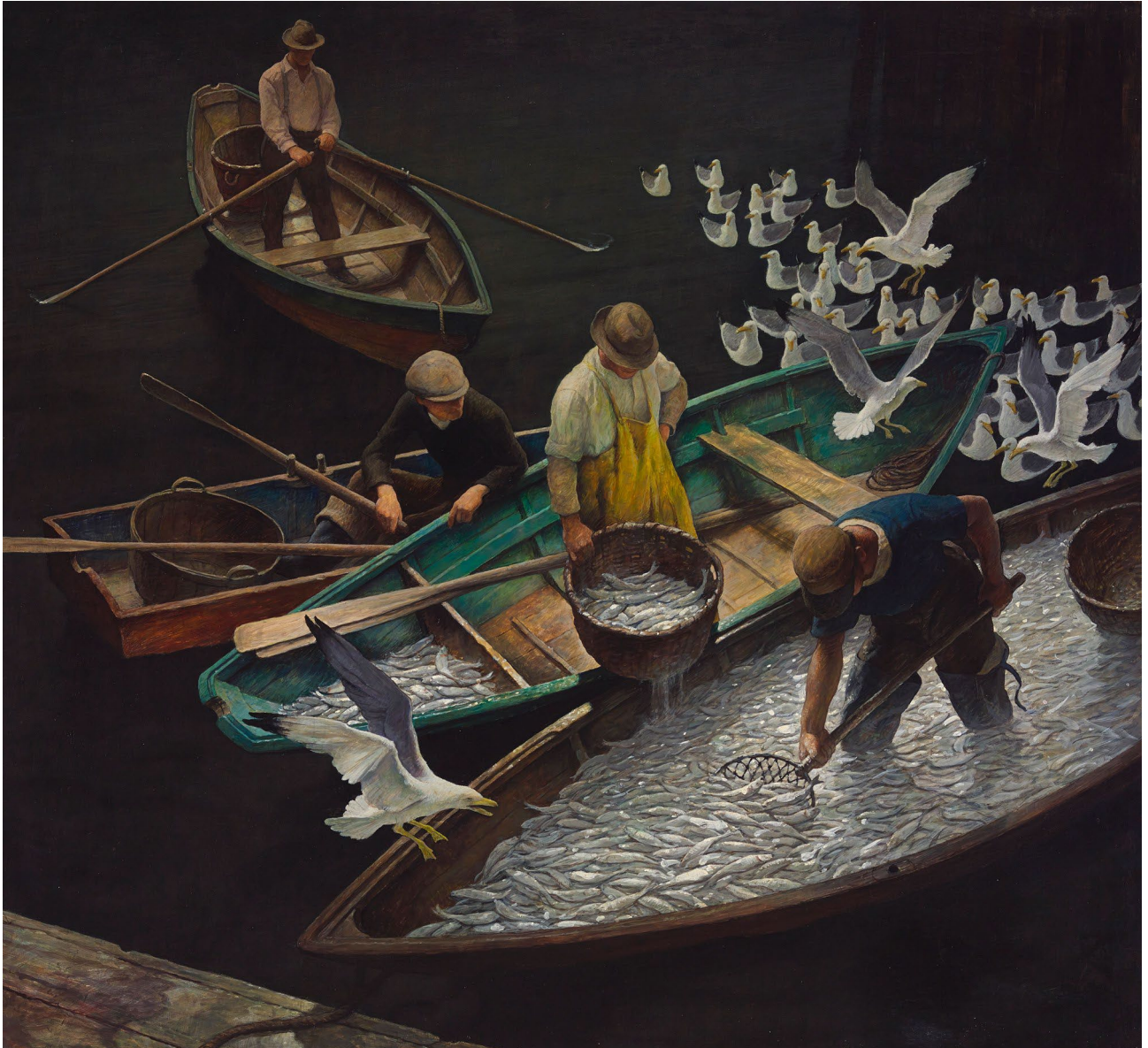
Newell Convers Wyeth (United States, 1882-1945) Dark Harbor Fishermen, 1943