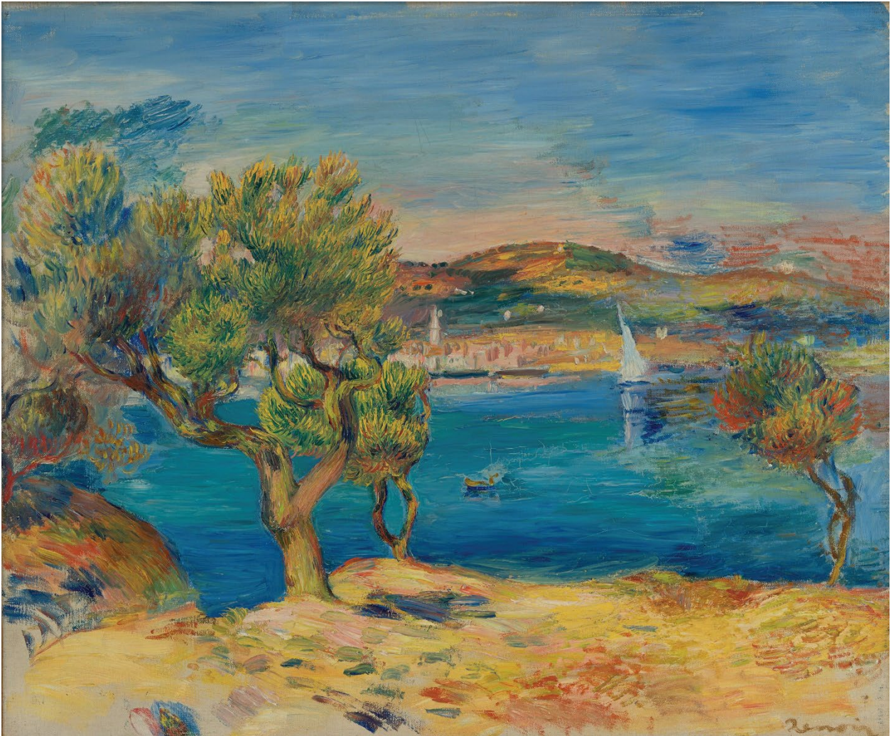
Pierre-Auguste Renoir (France, 1841-1919) L'Estaque, 1885-1890