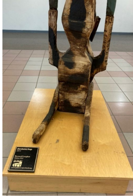
Figure 5: Public art plaque replacement