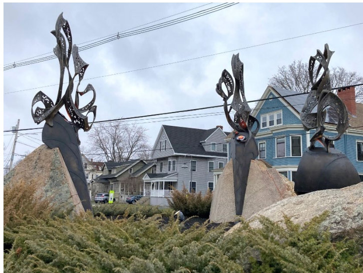
Figure 3: Passing the Torch sculpture light replacement

The existing artwork features lighting integrated within the sculptures and the perimeter planted area of the Deering Avenue roundabout. One sculpture light was replaced to correct color temperature issues, and two stem-mounted lights were replaced to resolve outages.