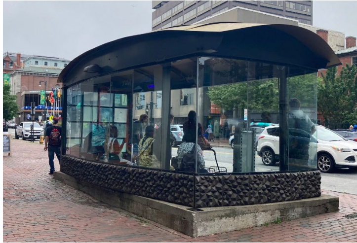
Figure 4: Jewel box bus shelter

public resource. City staff are working with the artist, Metro, contractors, and other city departments to identify alternative solutions for more sustainable maintenance and improved usability for public transit riders.