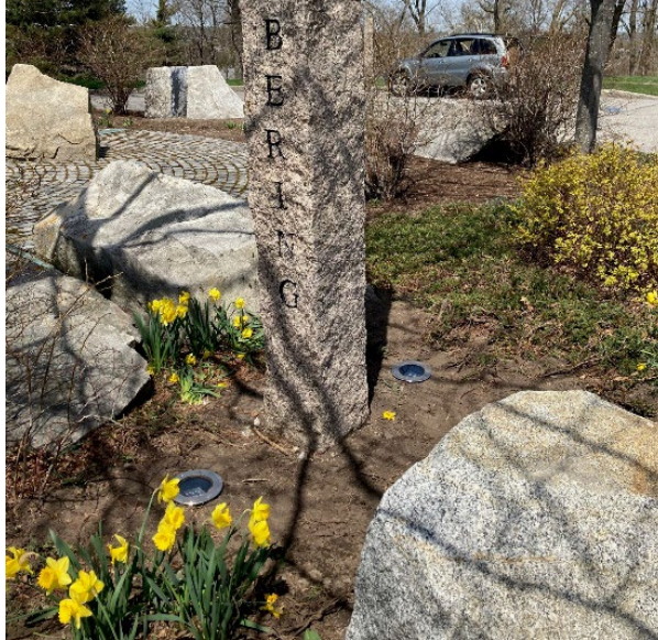
Figure 2: New in-ground lights at the granite sentinel post