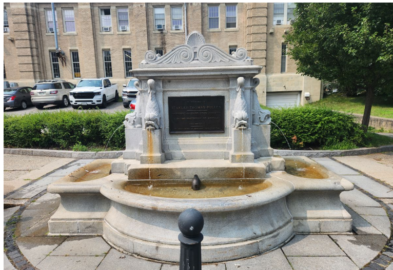
Figure 1: After treatment photo of Pullen fountain

A protective hot-wax coating was applied to the existing plaque; mortar patches were toned to match the granite; missing mortar between the granite blocks was replaced; and the fountain was cleaned with a low-pressure power wash.