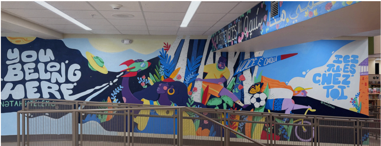
You Belong Here, 2025 Reiche School, Portland, ME

Reiche School, nestled in the heart of Portland, ME, is home to a vibrant and diverse student community. To add a splash of joy to their daily routine, the school decided to create a welcoming mural. This colorful project was brought to life with the enthusiastic participation of students and staff, who contributed their ideas and aspirations.