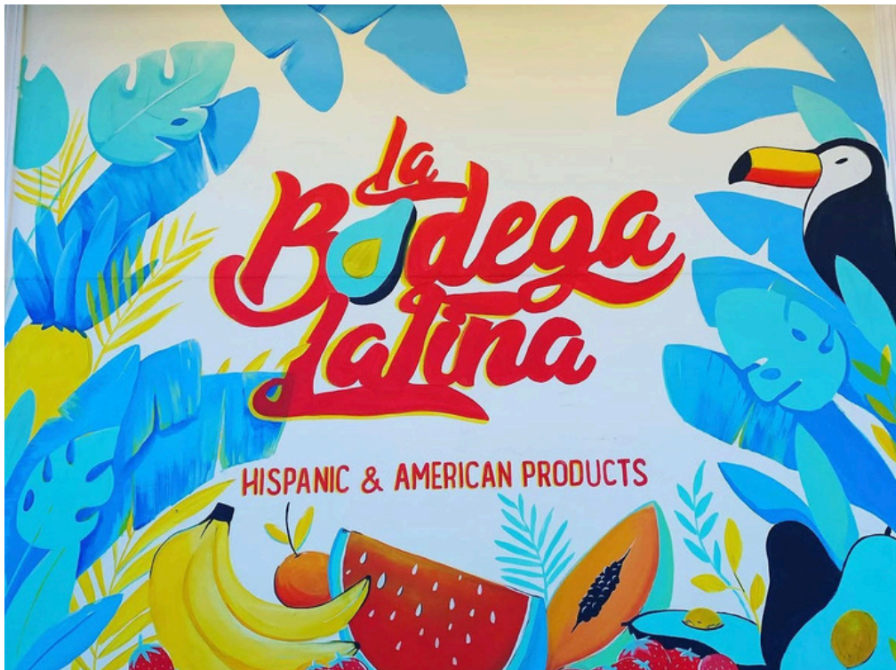
La Bodega Latina, Portland, ME, 2020