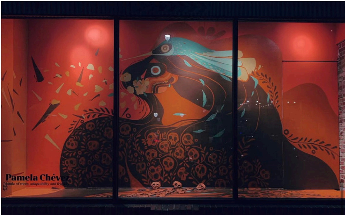
SPACE Gallery, Portland, ME, 2022